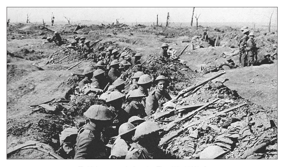
[British troops during the First World War]